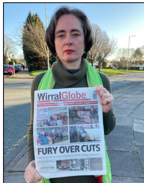
Globe headline sums it up after Labour and Conservatives passed cuts budget